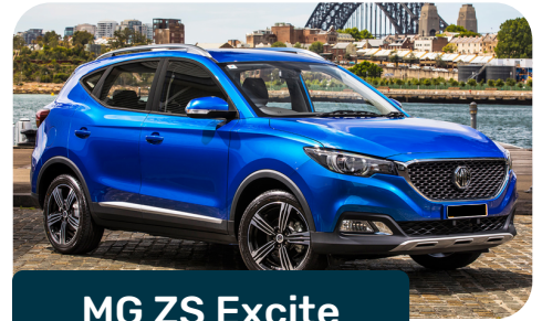
MG ZS Excite