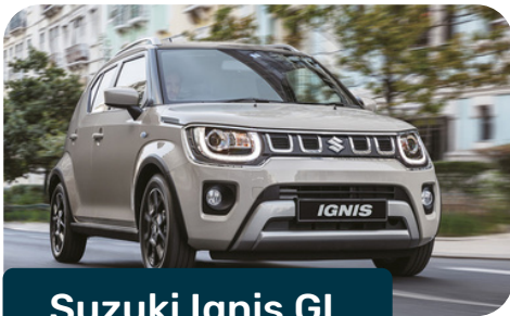
Suzuki Ignis GL