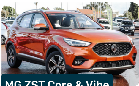
MG ZST Core & Vibe